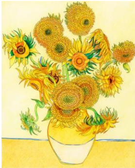
Van Gogh's Sunflowers

The North Grade Art Club is excited to announce their participation in the upcoming Lake Worth Street Painting Festival, where they will recreate Vincent van Gogh's famous artwork, "Sunflowers." If you're interested in seeing this work of art in person, make sure to visit Lake Ave during the festival on February 22 nd and 23 rd , 2025.